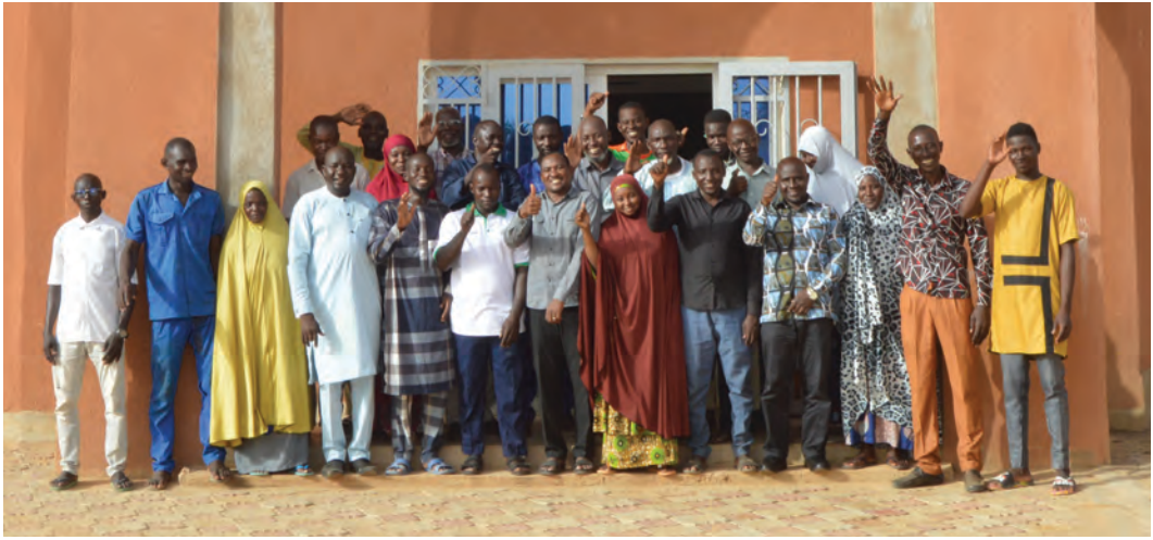
Members of LIBO, the NGO managing EPN projects in Niger, gather outside the EPN Building on the Dov Institute campus. They are committed to launch technician training in 2024.

We're excited by the Dov Institute. It's innovative – the first in Niger to feature horticulture and the income-generating power of agriculture. Everything about it will be first class – from its facilities to its faculty, students, and programs. And we're well on our way. The campus is a showcase, our emphasis on experiential learning and practical skills is attracting great attention, and our knowledge and results are starting to turn heads. In the past year we've been sought out by Millennium Challenge Corporation, the Blair Institute, USAID and the US Embassy. We were disappointed to push back the launch of technician training another year. There was too much to do, too little time to get it done, and we were unwilling to compromise quality to meet an internal deadline. We fully intend to launch technician training next October despite the challenges the coup may pose.